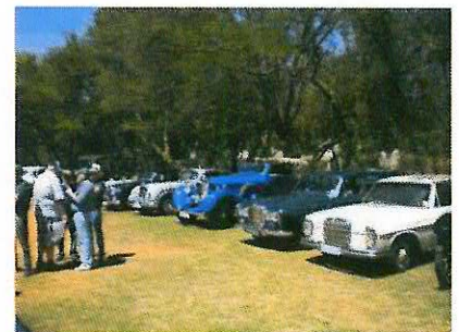
A row of magnificent cars