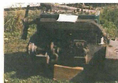
A factory fresh Stutz engine

The auction was a three day affair, billed as the "Opening of King Stutz Tomb". The auction attracted celebrity collectors, as well as thousands of curiosity seekers. The proceeds were in the millions, some items went far more than their value in the frenzy. In the end, the Internal Revenue Service took a hefty chunk of the cash for back taxes and the rest went to the church. The final tally was: $2.18 million at auction; $1 million in gold; $75 000 in silver and $400 000 in stock. Not bad for paupers!