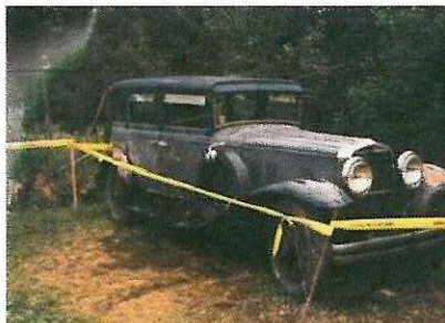
1931 Stutz SV16 Sedan $10 000