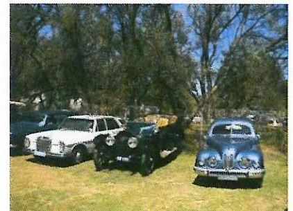
Mercedes, 1913 Cadillac & Bristol