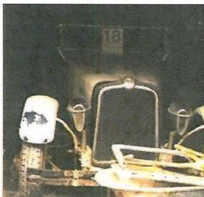
1928 Stutz Blackhawk Boattail Speedster $78 000