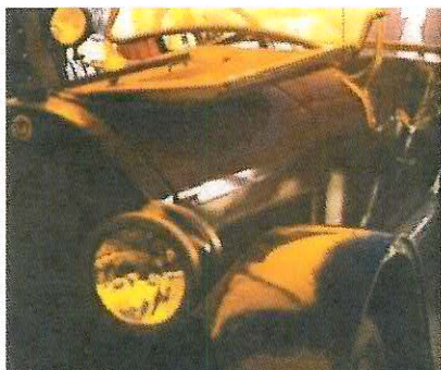
1921 Stutz Bearcat $58 000