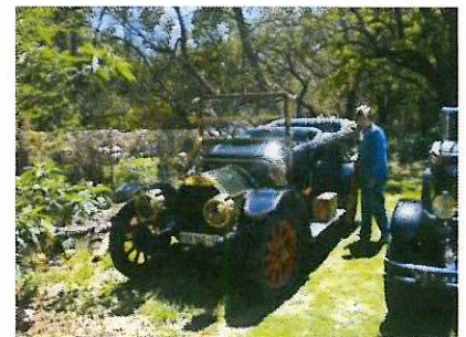
The Watson's 1911 Fiat 12/14