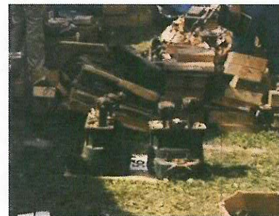
New Stutz parts still in boxes.