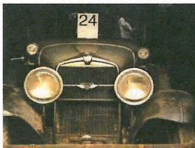
1929 Stutz Blackhawk $7 000