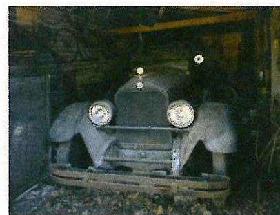
1923 Stutz Special Six $50 000