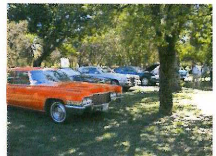
A row of beautiful Cadillacs