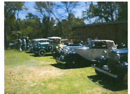
Fords and Bentleys