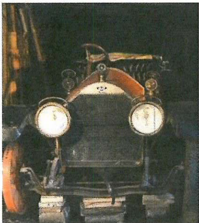
1913 Stutz Bearcat $105 000