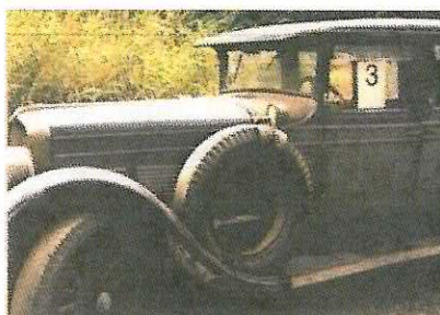
1927 Stutz AA Sedan $65 000