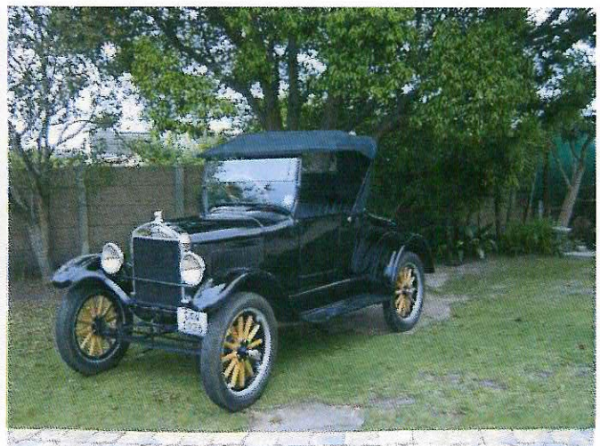
The final product in September 2011