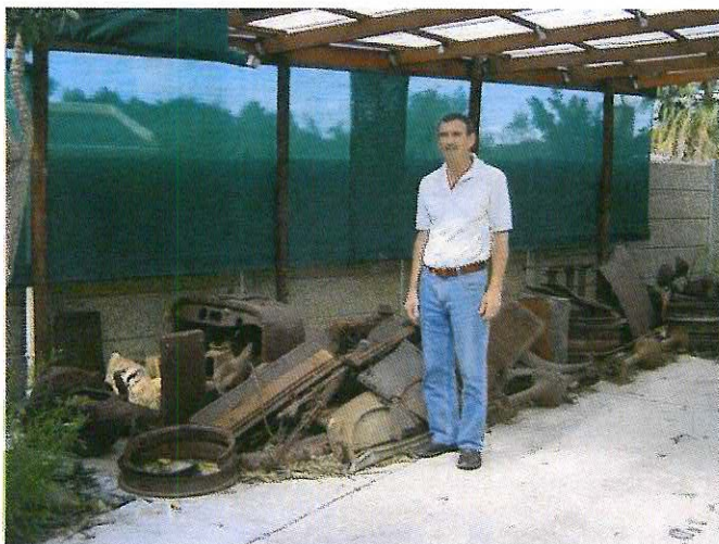
Start of the project in 2006