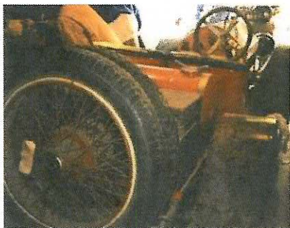
1916 Stutz Bearcat $155 000