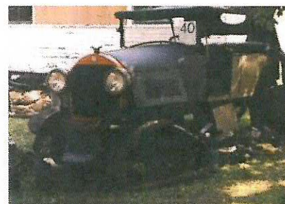
1922 Stutz Tourer $10 000