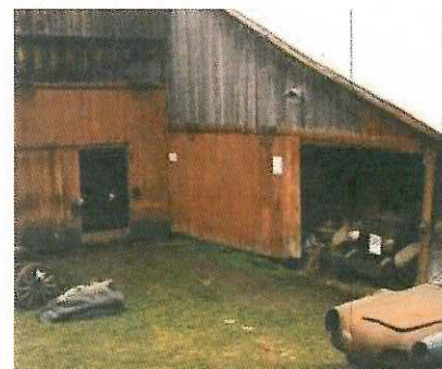
A '28 Franklin & '23 HCS in a barn

Over the years, the farm appeared to grow more and more forlorn, even as the collection was growing.