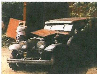
1932 Stutz DV32 Sedan $27 000