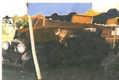
1929 Stutz LeBaron $68 000